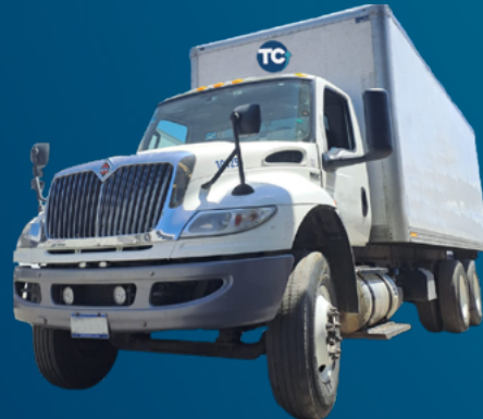
toRton 8 tons

Ability: 16 pallets Burden: 2 axles, 8 Tons. Burden: 3 axles, 10 Tons. Net weight: 7.5 tons Dimensions: 71.5 m3