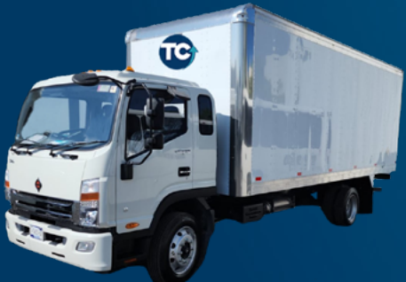
Tailless 5 tons

Ability: 6 pallets Burden: 5 Tons. Net weight: 3.5 Tons. Dimensions: 31.2 m3