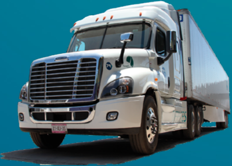
tractor-truck 20-25 tons

Ability: 24 pallets Box: 53 Fts. Aerodynamics Tech.: EcoSkirt, FlowBelow, Tail, Cat's Eye trailer.