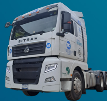
Gas 11 tons

Ability: 24 pallets Burden: 504 Lts. Net weight: 11 Tons. ECO Transport: for the environment Drag Cap.: 20 – 25 Ton.